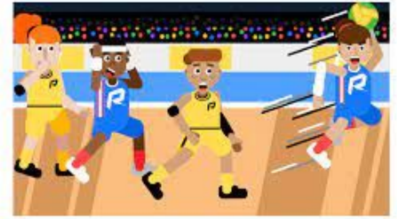
How Does Scoring Work In Handball?

https://www.bbc.co.uk/bitesize/guides/zywwmnb/revision/3